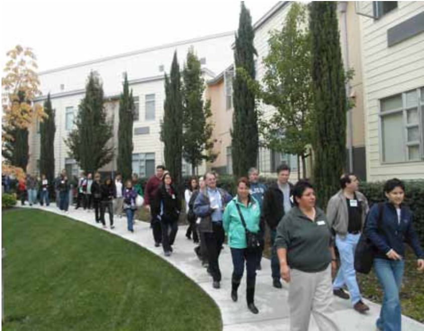
Greenbelt Alliance led residents, decision-makers, and Sunnyvale Horizon 2035 committee members on a tour of South Bay Caltrain stations and nearby homes in Mountain View and Redwood City.