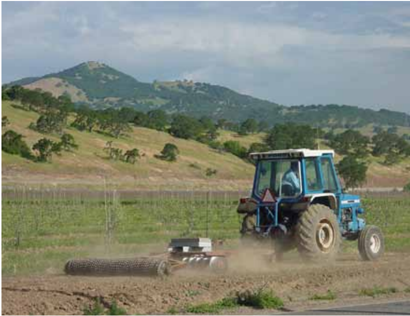
Each Sonoma County city now has an urban growth boundary protecting agricultural land and open space from development. Greenbelt Alliance played a lead role in the three lines at stake in 2010.