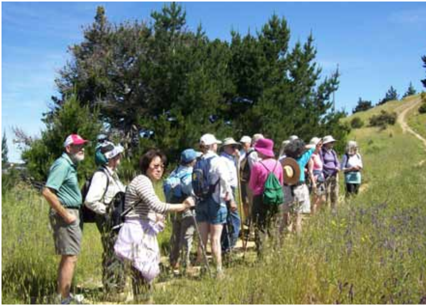
Greenbelt Alliance held over 50 Greenbelt Outings including Get to the Point, highlighting a brand new section of the San Francisco Bay trail in Richmond.